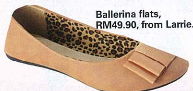
Ballerina flats, RM49.90, from Larrie.