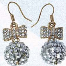
Earrings, RM79, from Shoes Shoes Shoes.