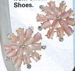
Earrings, RM69, from Shoes Shoes Shoes.