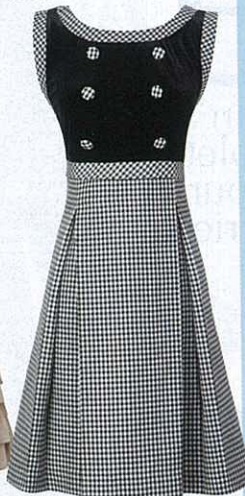
Dress, RM999, from Bran et Daguët.