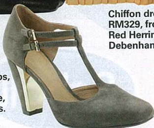
T-bar pumps, price unavailable, from Clarks.