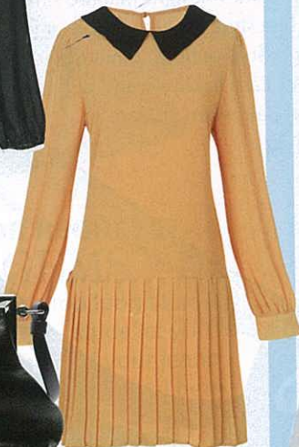
Chiffon dress, RM329, from Red Herring at Debenhams.