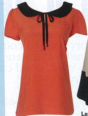
Collar blouse, RM165, from Red Herring at Debenhams.