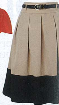
Leather-detail skirt, RM199, from Miss Selfridge.