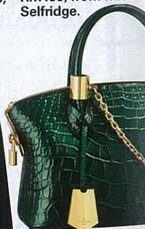
Crocodile leather bag, price upon request from Louis Vuitton.