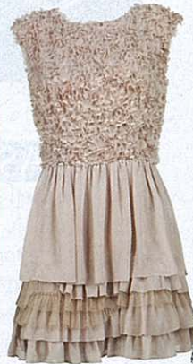
Dress, RM840, from Ted Baker.