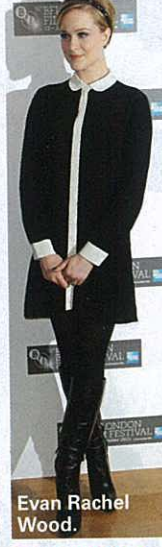
Evan Rachel Wood.