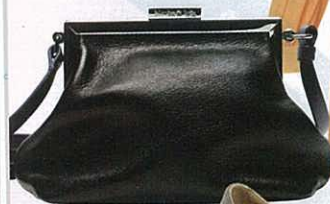
Clutch bag, RM700, from Bimba & Lola.