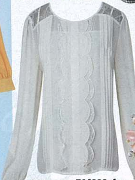
Lace top, RM299, from Marks & Spencer.