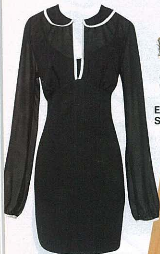
Dress, RM209, from Miss Selfridge.

TIP: Go head-to-toe in one tone – it is both slimming and sophisticated.