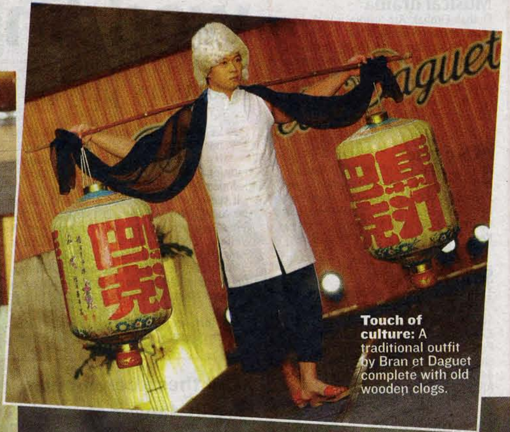
Touch of culture: A traditional outfit by Bran et Daguët complete with old wooden clogs.

pull back about 30% to respect our local (conservative) culture.