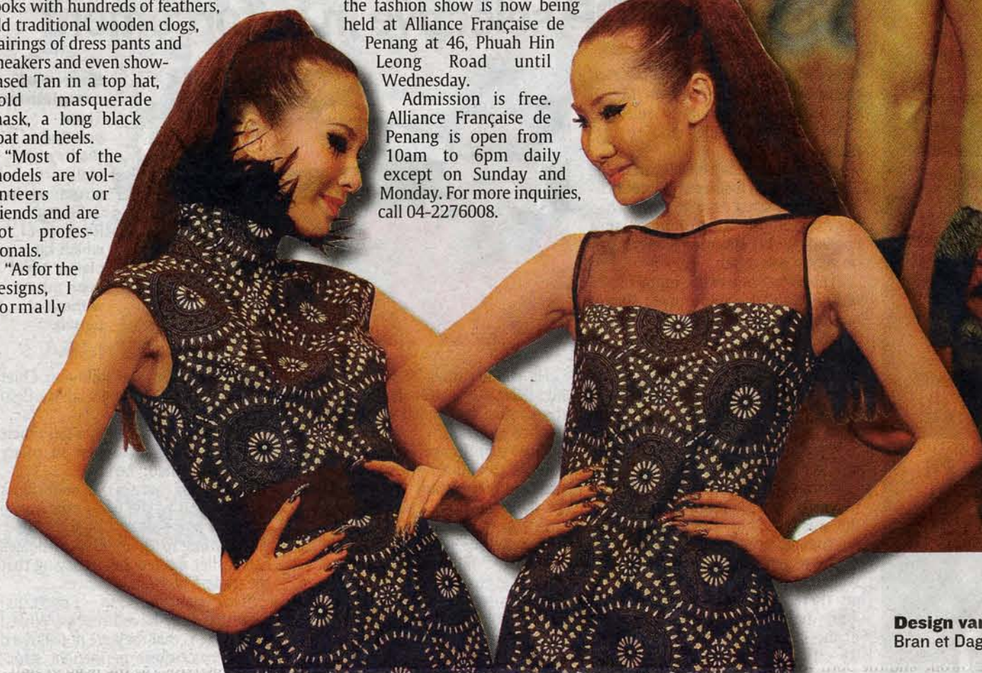
Design variations: Models showing off Bran et Daguët dresses.